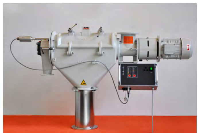
The cyclone screener type E360 in epoxy coated aluminium casting. Ultrasonic assistance retrofitted.