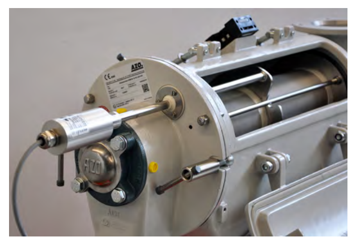
Screen basket with ultrasonic converter. The frequencies were transmitted to the wire mesh via the middle screen ring. The stainless steel wire mesh is bonded with the screen rings.