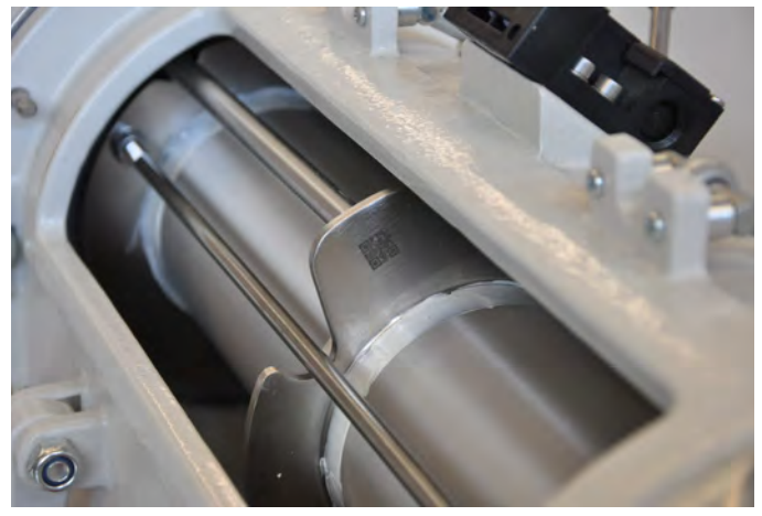
Distinct labelling of the screen basket. Identification by QR code