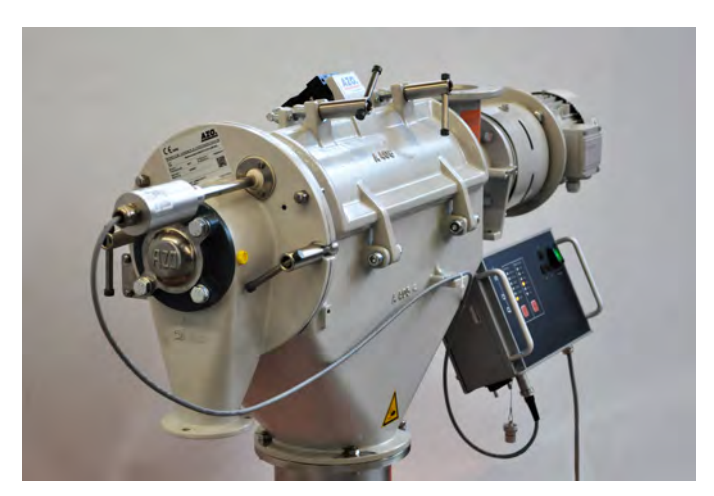
Cyclone screener with mounted ultrasonic converter and generator