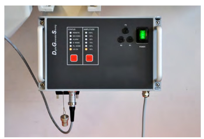
Generator for the generation of ultrasonic frequencies inclusive controls